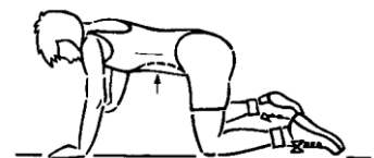
"The Complete Guide to Postnatal Fitness"

Many other Core stability and strength exercise will be taught during your postnatal exercise class.